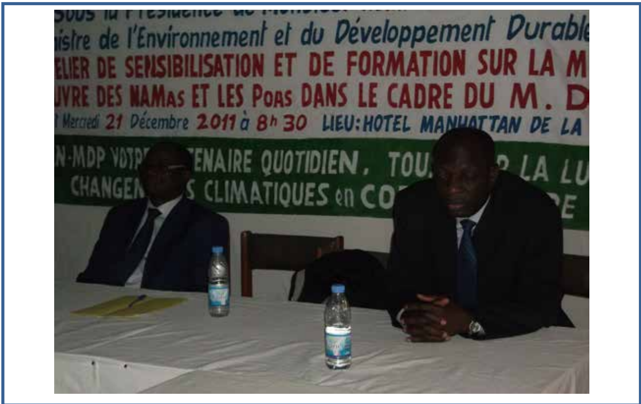
Figure 9: Workshop PoAs & NAMAs