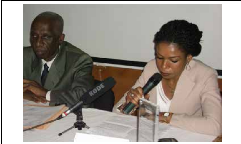
Figure 10: Opening ceremony – Workshop PoAs & NAMAs

She concluded her remarks by the official presentation of the trophy for "Best 2011 African DNA Communicator" awarded in Durban, South Africa, by the Executive Secretariat of the United Nations Framework Convention on Climate Change (UNFCCC) to the CDM DNA of Côte d'Ivoire.